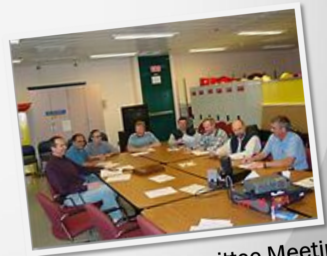
Offshore JOHS Committee Meeting